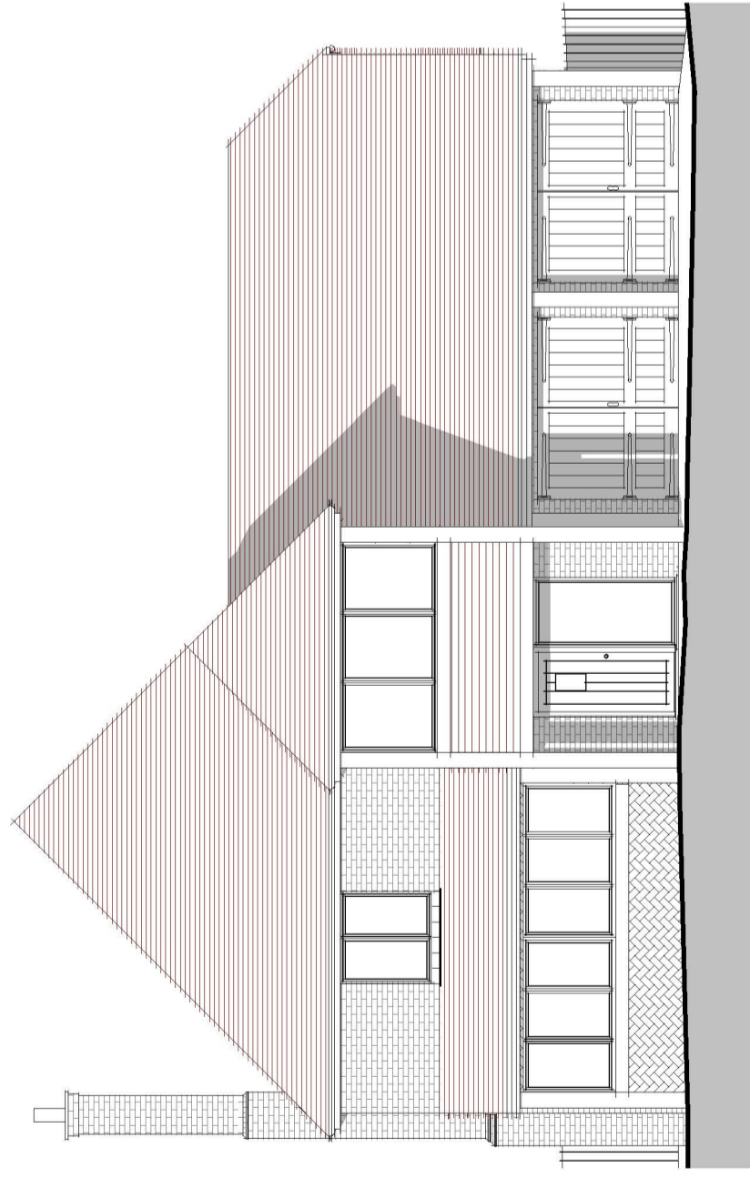
Elevation - Plot 3 - North 1 : 100